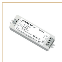
Sterownik do taśm jednokolorowych Single colour LED strips controller