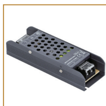
Zasilacz modułowy 100W Modular power supply 100W