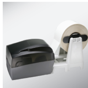
High cost-effectiveness for large amount printing