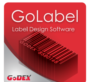
Free labeling software GoLabel for easy printing