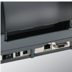
Ethernet, Serial and USB ports included

Use the G300 for all you light to medium duty thermal transfer barcode printing applications