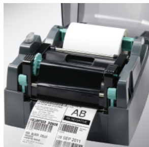
Uses standard low-cost labels and ribbons